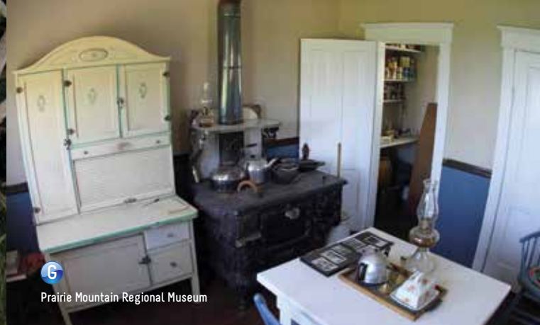
6 Prairie Mountain Regional Museum

The arrival of the railway early in the 20th century brought an influx of European settlers to the Prairie Mountains, transforming the area into one of the richest grain-producing regions in the world. As the plow transformed grasslands to fields of grain, so too did the hearts of the settlers transform the landscape of the region. The lingering spirit of these pioneers can still be felt in the area's historical sites and buildings, some of which are highlighted here.