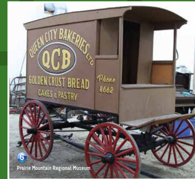
6 Prairie Mountain Regional Museum

This brochure was originally produced by Parkland Tourism Association. Funding for the current edition was provided by Rossburn CDC with the collaboration of the featured municipalities. We are thankful as well for contributions from Parkland Tourism Association, Travel Manitoba, and Asessippi Parkland Tourism.